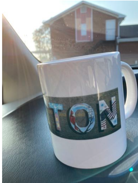
Our new mugs feature the “ELKTON” mural on the side of “Sweet Caroline’s” in Elkton!