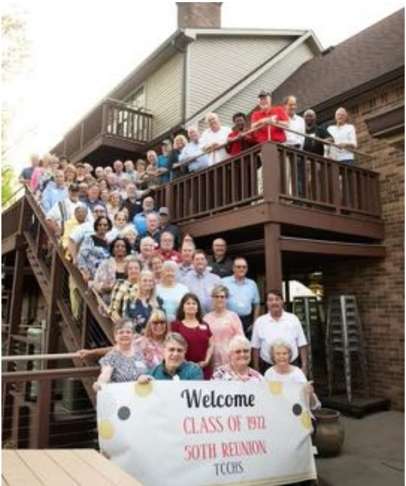
TCCHS Class of 1972 50 th Class Reunion